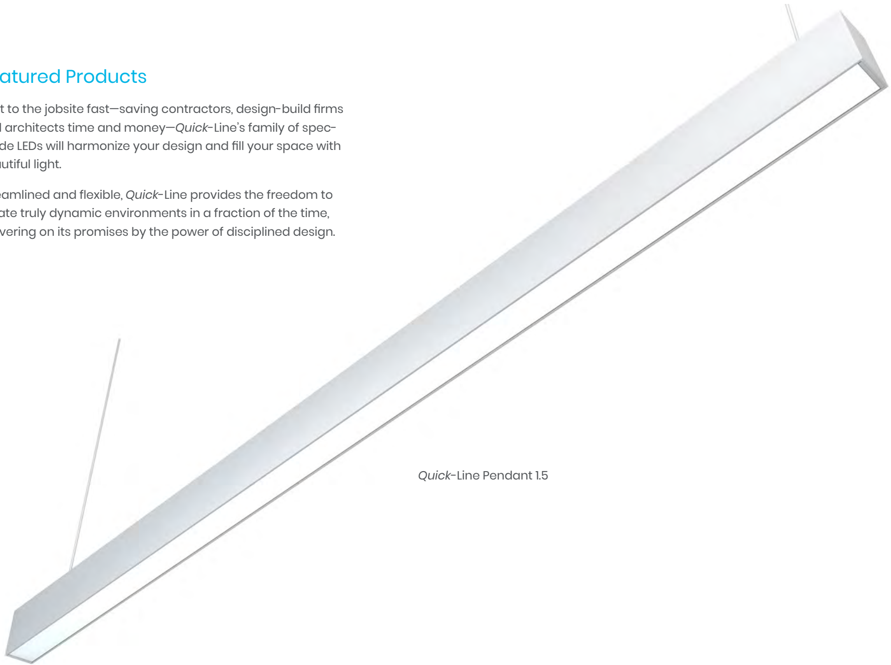
Quick-Line Pendant 1.5

Streamlined and flexible, Quick-Line provides the freedom to create truly dynamic environments in a fraction of the time, delivering on its promises by the power of disciplined design.